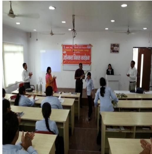
Entrepreneurial Development session in progress.