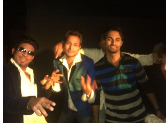
Glimpses of the party