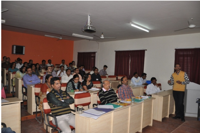
Progress Seminar of Research Scholars (Ph.D/ME by Research) at GHRCE, Nagpur