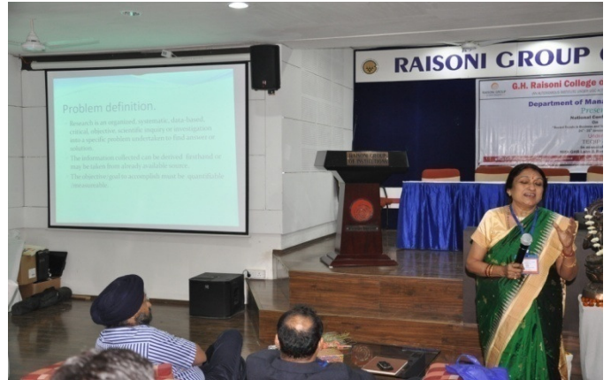
Photograph: Glimpses of the Workshop