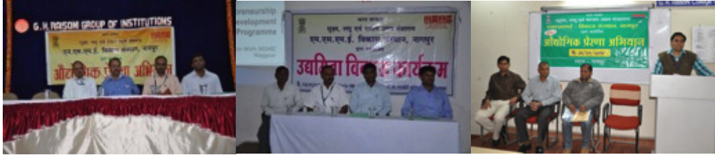
Glimpses of MSME-Industry Motivation Campaign