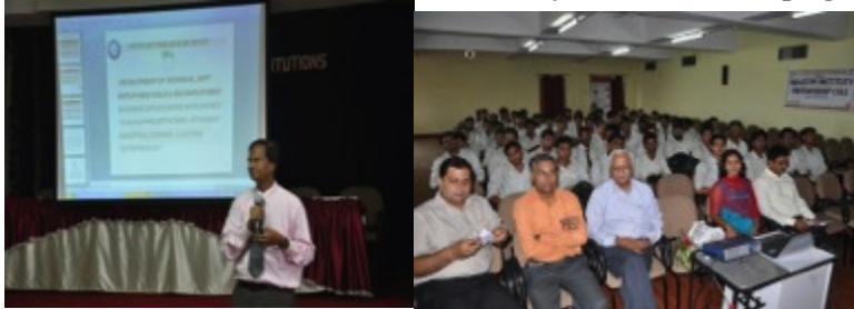
Chief Engineer, MADC addressing MCED programme